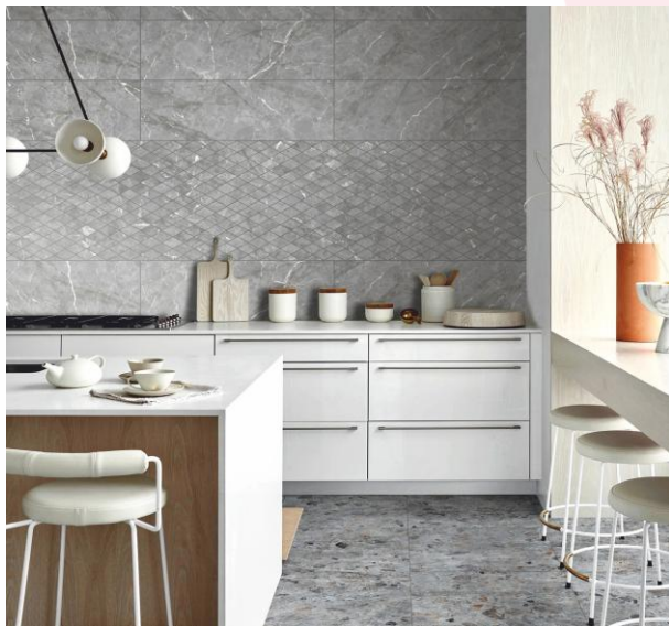
Mosaic Nice 7 300x300