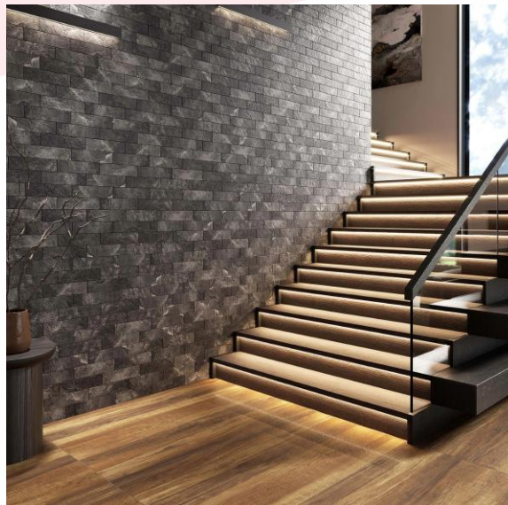
Colorado 4 245x65