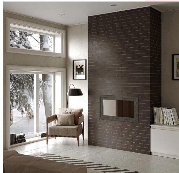
Kuba 6 245x65