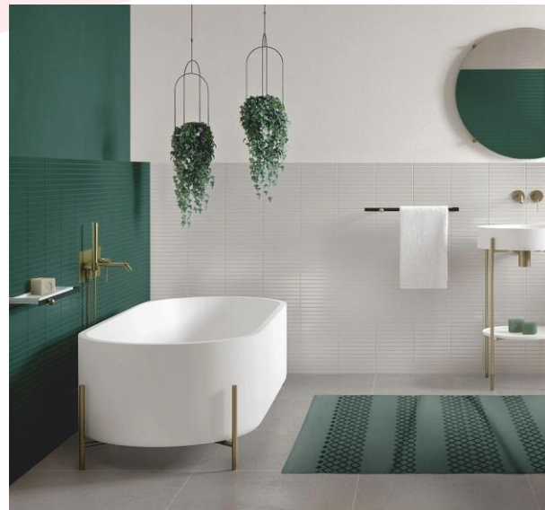
Mosaic Insight 7 300x195