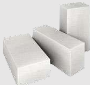
Cellular concrete blocks